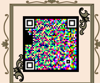
2 Hiroshima Peace Memorialuct

THE HIROSHIMA PEACE MEMORIAL (GENBAKU DOME) WAS THE ONLY STRUCTURE LEFT STANDING AFTER THE FIRST ATOMIC BOMB EXPLODED ON AUGUST 6, 1945. IT HAS BEEN PRESERVED EXACTLY AS IT WAS IMMEDIATELY FOLLOWING THE EXPLOSION AS A REMINDER OF THE MOST DESTRUCTIVE FORCE EVER CREATED BY MAN. IT IS ALSO A CRY FOR WORLD PEACE AND THE END TO THE PROLIFERATION OF NUCLEAR WEAPONS.