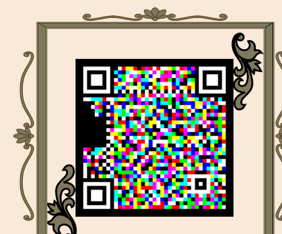
6 Nijojo castle

BUILT IN 1603 IN KYOTO, JAPAN, THE NIJO-JO CASTLE WAS THE RESIDENCE OF THE TOKUGAWA SHOGUNS, WHO RULED JAPAN FROM 1603 TO 1868. IT REMAINS AS AN ELEGANT DISPLAY OF ARCHITECTURE AND POWER.