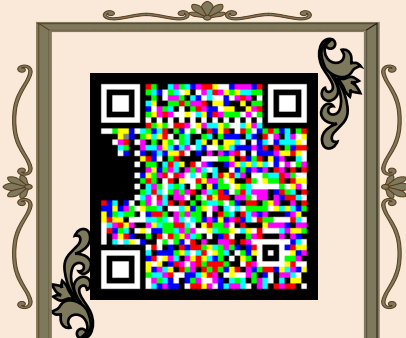
3 Himeji-jo castlet

DATING BACK TO 1333, HIMEJI-JO CASTLE WAS BUILT IN THE CENTER OF HIMEJI CITY, ABOUT 50 KILOMETERS WEST OF KOBE. THIS IS THE MOST VISITED CASTLE IN JAPAN AND IS REGARDED AS THE FINEST SURVIVING EXAMPLE OF JAPANESE CASTLE ARCHITECTURE.