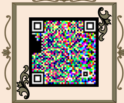
1 Itsukushima Shirine

THE ARCHITECTURALLY ELEGANT ITSUKUSHIMA SHRINE AND ITS ENTRANCE GATE WERE CONSTRUCTED LIKE A PIER OVER WATER, TO APPEAR AS IF IT IS LEVITATING. RETAINING THE PURITY OF THE SHRINE IS SO PARAMOUNT THAT NO DEATHS OR BIRTHS ARE PERMITTED NEAR THE SHRINE.